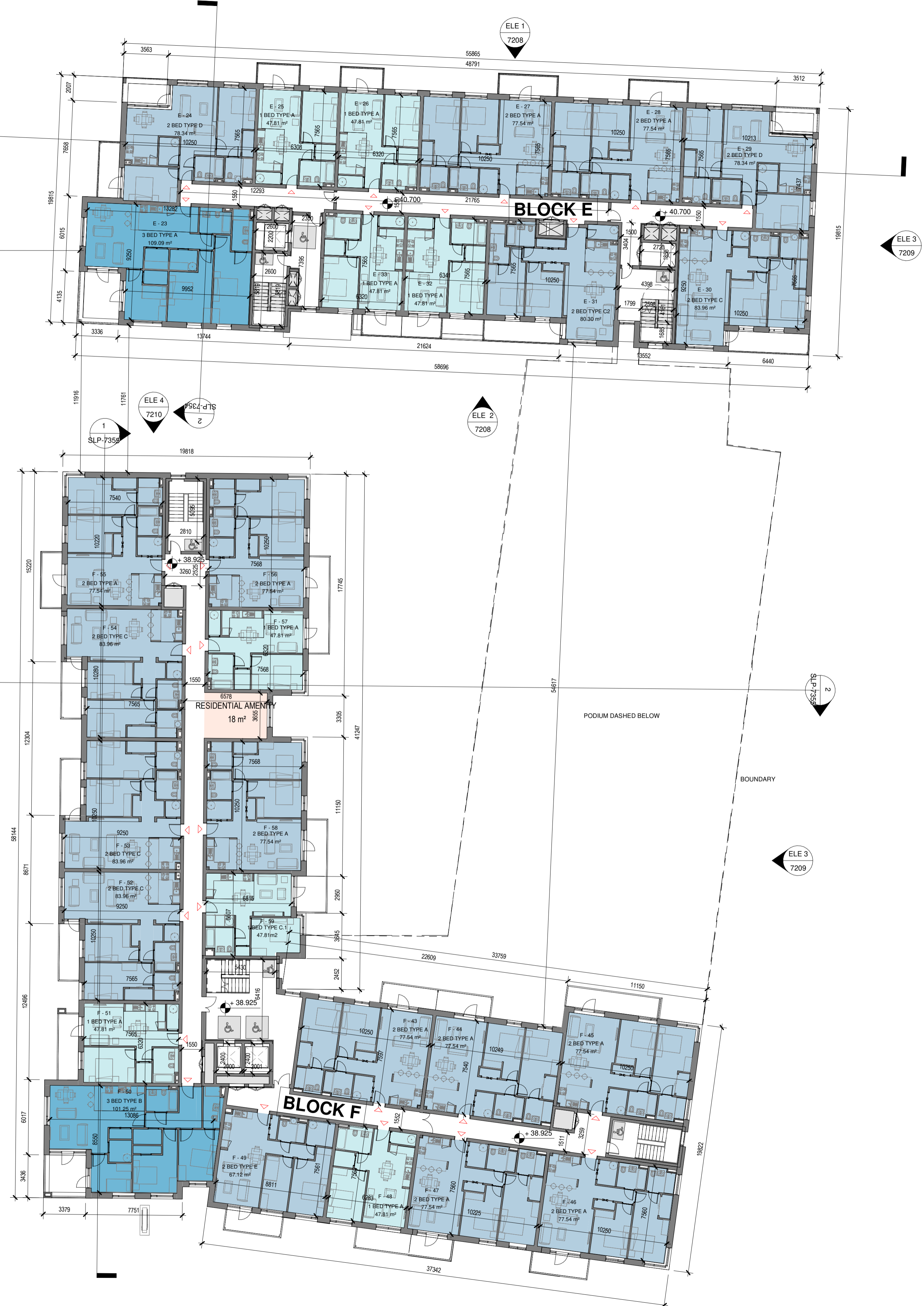
1 Floor Plan Level 03 Block E_F 1 : 200

MATCHLINE DRG. REFERENCE P18179-RAU-ZZ-XX-DR-A-SLP-7000